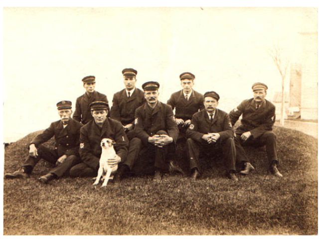
The South Manitou Life Saving Service crew posing for a photograph. The keeper is located on the far left noted with the insignia on his hat.

Location: SANDY POINT/S. MANITOU ISLAND/LAKE