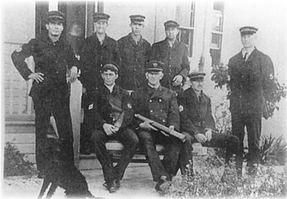
NPS - Sleeping Bear Dunes National Lakeshore