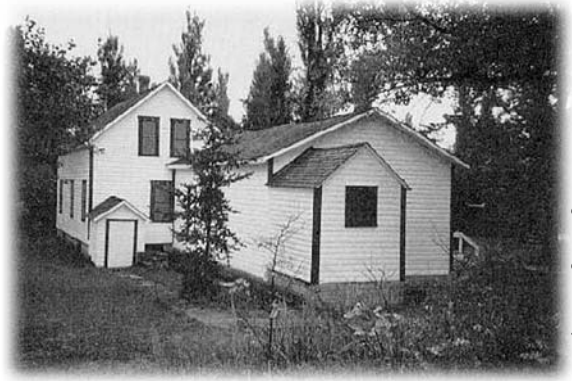
NPS – “Coming Through With Rye”