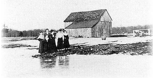
"Coming Through With Rye"