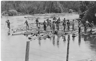
Internet - Roy Dodge

Lumbering was a matter of indiscriminate clear cutting back in those times. The wood choppers moved across hill and vale leaving wastelands of stumps and brush as far as the eye could see. The operators, having no further use for such land, usually tried to sell it off as farmland. But land along the