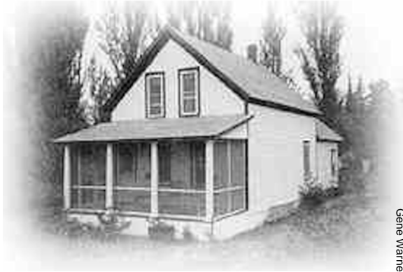
Theodore Thompson House c2005