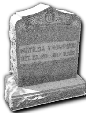
MIA Cemetery Survey