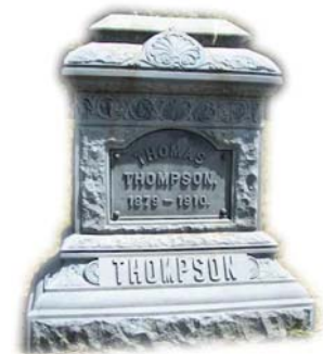
MIA Cemetery Survey