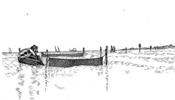
Internet - lehringlowrb.com

pound. By way of “fish stories,” it is told that he went out to recover his catch one morning, and discovered that he’d captured a fish so big, he knew he couldn’t handle it alone. At about the same time a Navy training ship was in the harbor and, noticing some of the sailors out in their launch, he hailed them over to help bring the big fish up out of the water. A couple of the men got into Theodore’s pond boat, and it took those two plus Theodore to pull the big fish into his boat. It was lake sturgeon; not big by lake sturgeon standards, but it still weighed some 170 pounds when they got it on the scales. In order to clean the primitive-looking fish they had to fetch a block and tackle to hoist it up to the ceiling in the fish shanty. Theodore then gutted it out and cut it into several pieces, completely filling two fish boxes. When iced and shipped to Chicago, the sturgeon brought a bonus price – forty-five cents per pound! 32