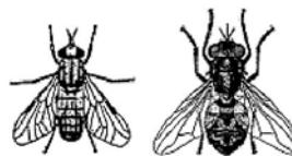
DEER FLY STABLE FLY

Susceptibility varies from one person to another, and even from time to time for the same person. The best "remedy" for poison ivy is to avoid it. Having failed that, the irritating Urushiol oil is water soluble and can easily be washed off, if done before the oil bonds to the skin, using plenty of cold water. Once the infection is established, a doctor may be needed to treat it. Liberal applications of very hot water (as hot as can be tolerated) sometimes helps release histamine, the substance in the cells of the skin which causes the intense itching, giving several hours of relief.