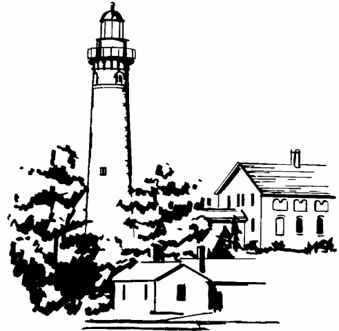
Sleeping Bear Dunes National Lakeshore